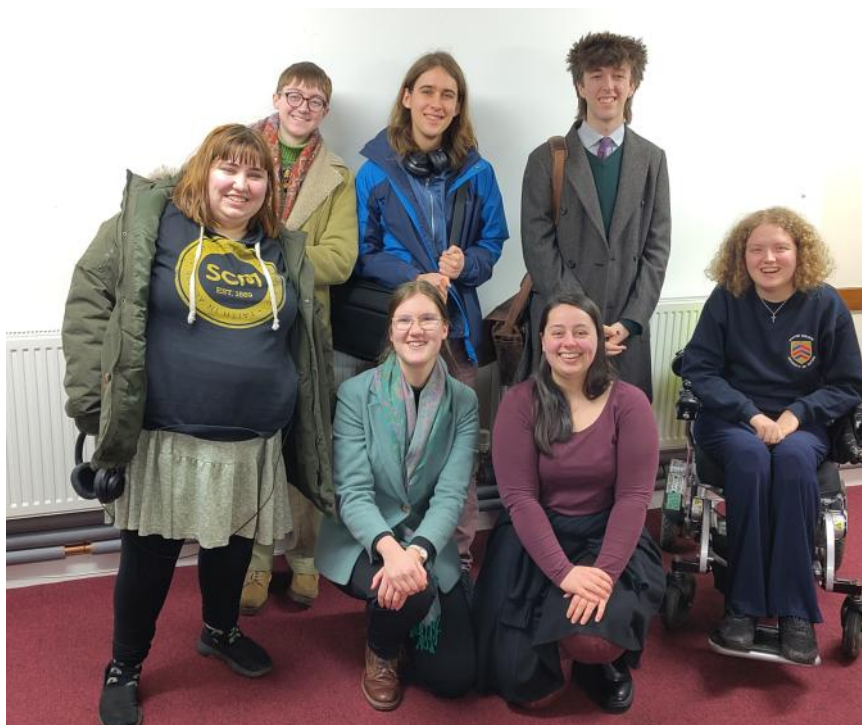
Some of the current General Council at the February 2025 GC meeting.